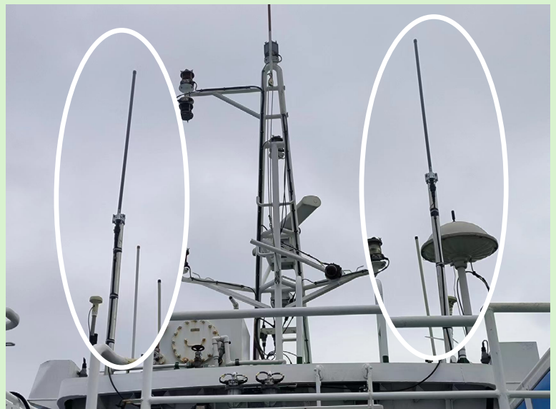
Application scenarios and Installation display