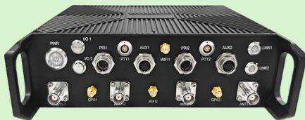
Dual-band Operation Simultaneously