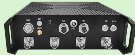
Four-band Selection Operate