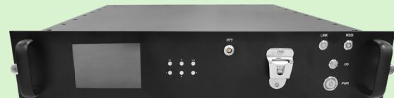
19" 2U Standard Rack With Display